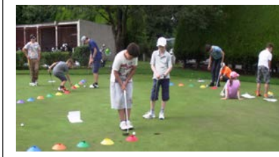
Club golf Camp