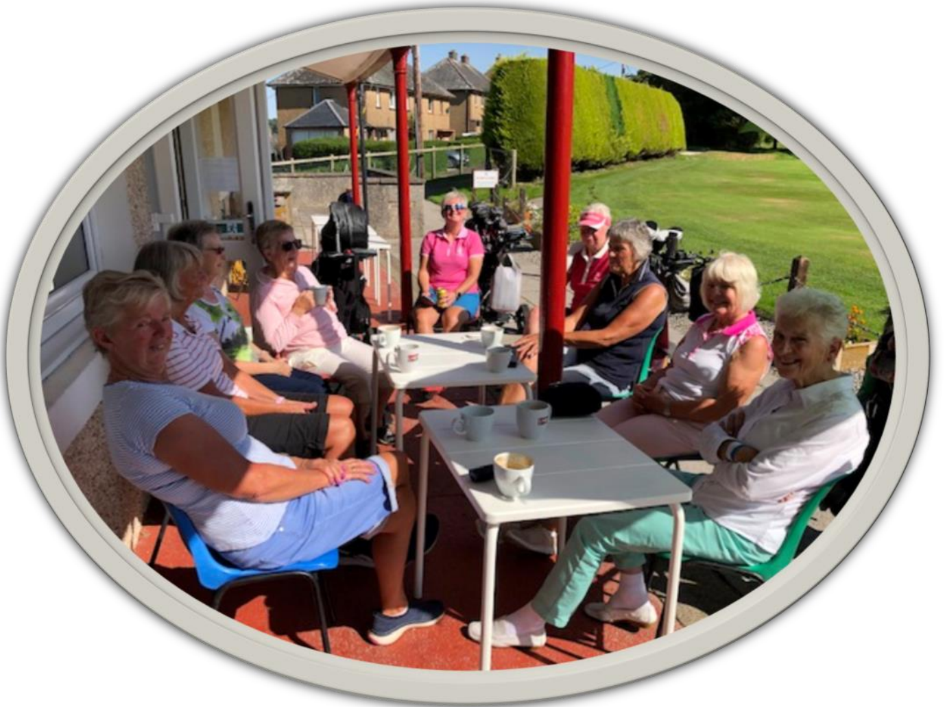
Several of the Ladies' section enjoying a coffee and some sunshine—September 2023.

The Ladies hadn't had an official Finals Day due to bad weather but the Ladies finals competitions, championship and Handicap competitions were played as and when weather allowed. They had held a successful Presentation Night (photos on the next few pages).