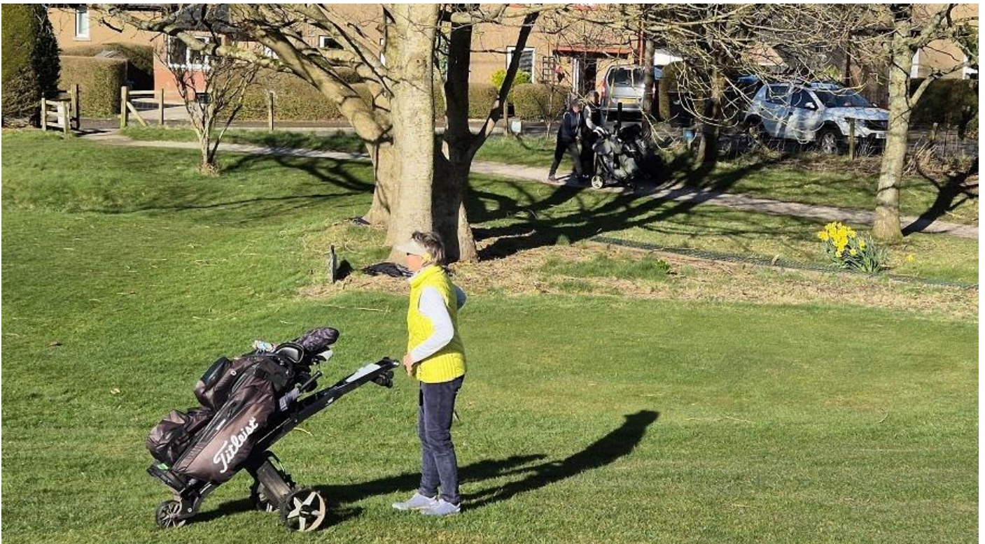
A lady wonders where the 17th hole flagstick is.