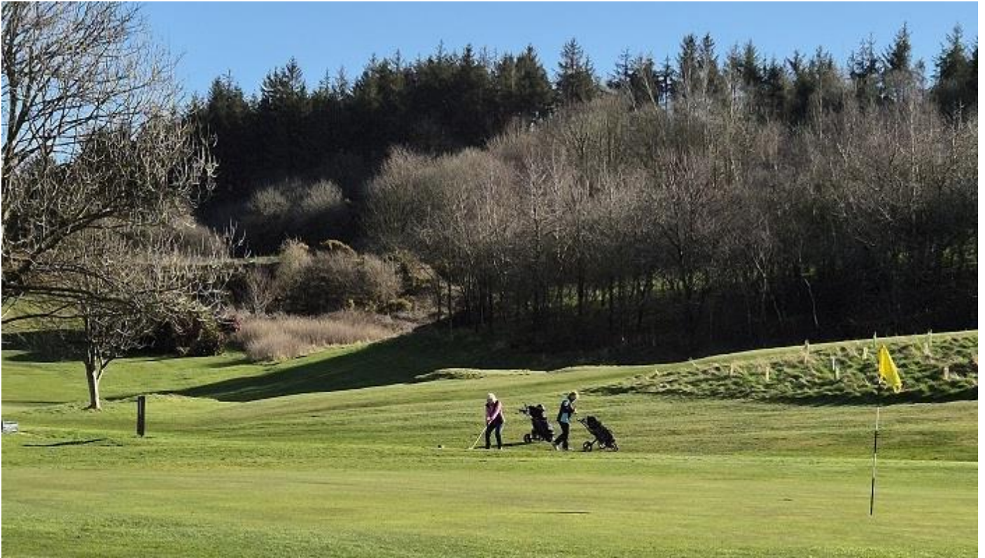
Some Ladies teeing off at the 17th