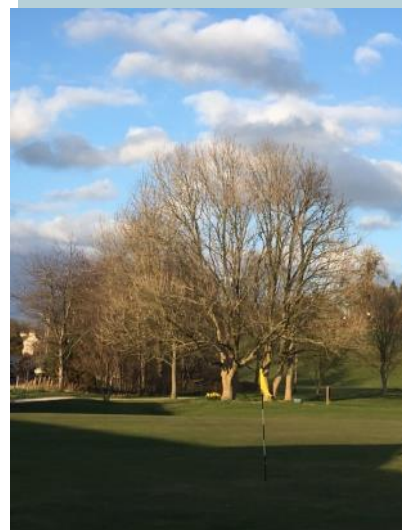
18th Green, March 2025